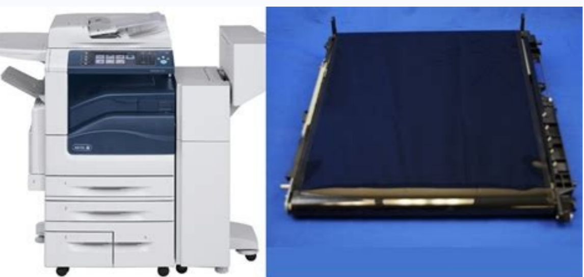
Xerox WorkCentre 7525/7530/7535/7545/7556 7830/7835/7845/7855 IBT BELT ASSY